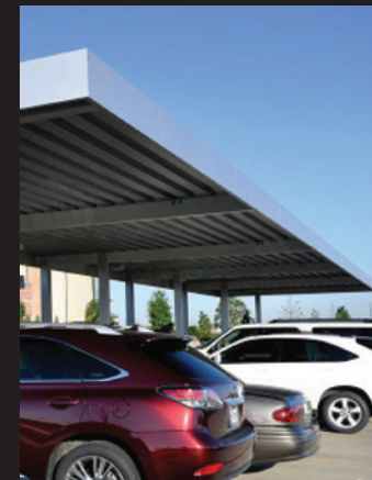
Newly Constructed Covered Parking (Coming Soon)