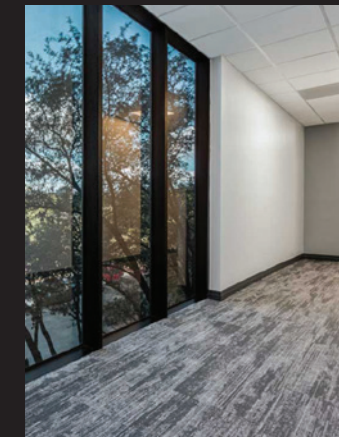
Renovated in 2020 by Architect Gensler