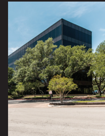
Easy Access Via 360 & Camp Craft Rd