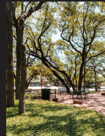
Hardscaped Outdoor Social Space